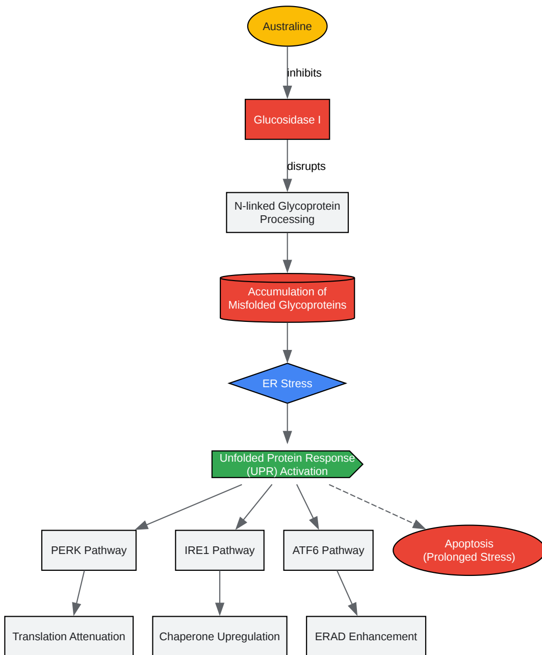
Figure 2: Australine-Induced UPR Signaling

Caption: A flowchart illustrating the key steps in the isolation and purification of australine .