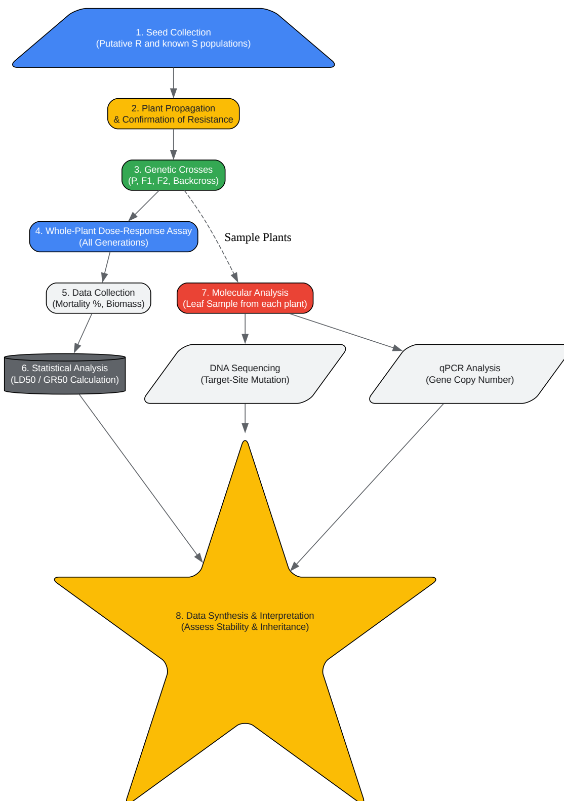
Figure 2: Experimental Workflow for Resistance Stability Assessment