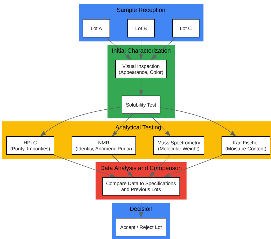
Workflow for Assessing Lot-to-Lot Variability of Methyl Fucopyranoside