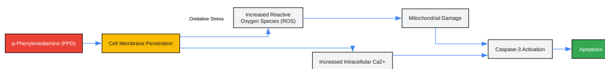
Diagram 1: Simplified PPD-Induced Cellular Toxicity Pathway

Click to download full resolution via product page