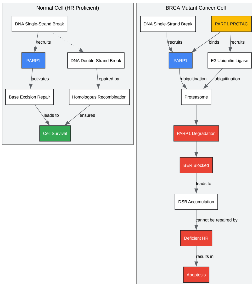
Mechanism of PARP1 PROTACs in BRCA Mutant Cancers

Click to download full resolution via product page