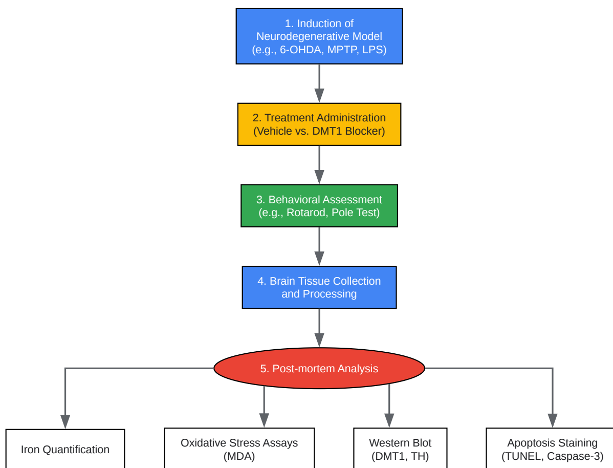
Figure 3: General Experimental Workflow

Detailed methodologies are crucial for the successful application and evaluation of DMT1 blockers in preclinical models.