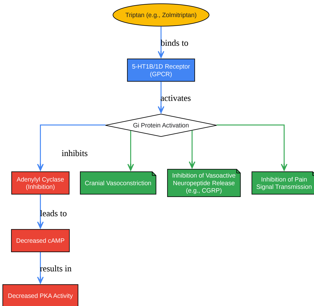
Diagram 3: Signaling Pathway of Triptans (Serotonin 5-HT 1B/1D Receptor Agonists)

Click to download full resolution via product page