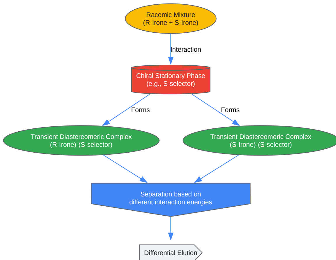
Figure 2: Principle of Chiral Separation on a CSP

Click to download full resolution via product page