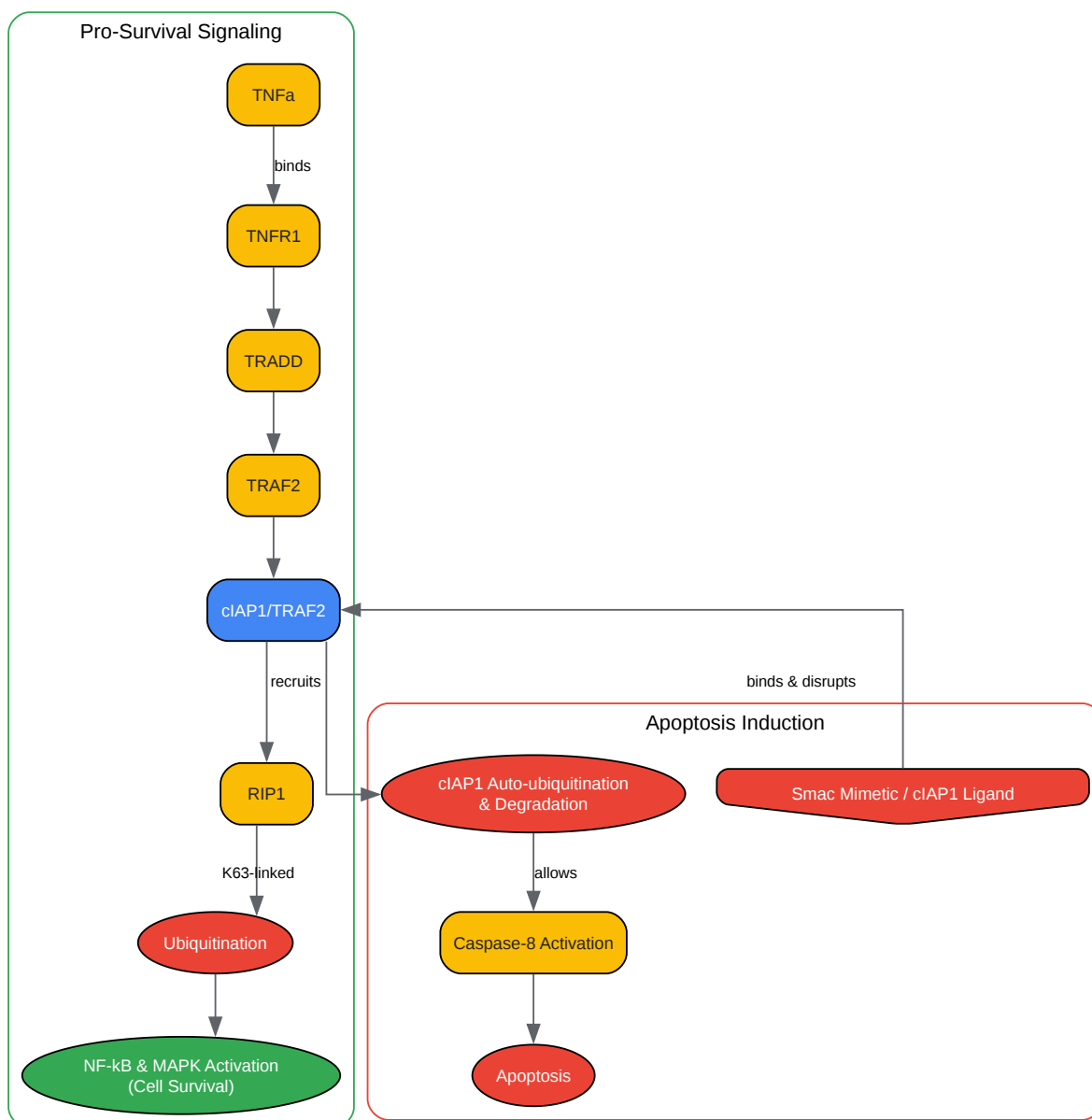
cIAP1 Signaling Pathway