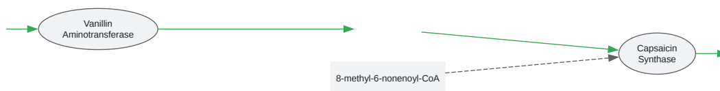
Figure 2: Biosynthesis pathway of capsaicin, highlighting the role of vanillylamine.

Click to download full resolution via product page