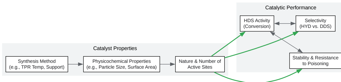
Relationship between Synthesis, Properties, and Performance of WP Catalysts

Click to download full resolution via product page