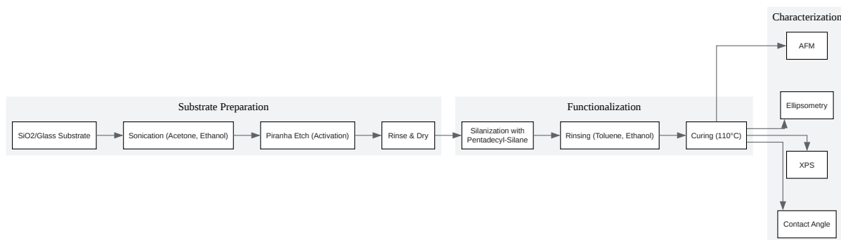
Experimental Workflow for Silanization