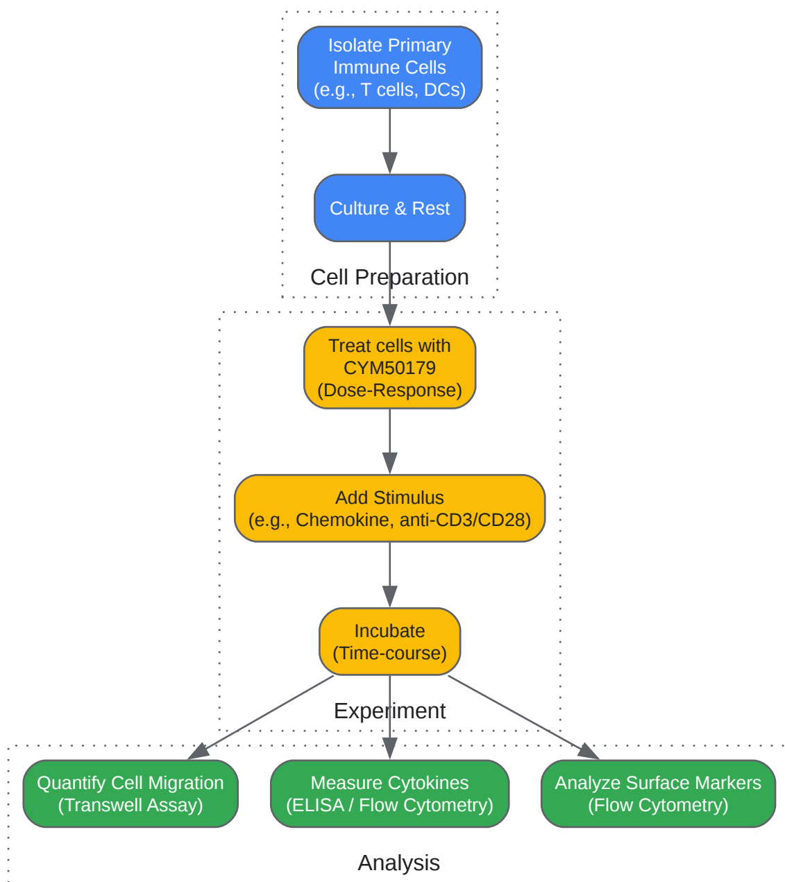
Figure 2. General Workflow for In Vitro Assays

Click to download full resolution via product page