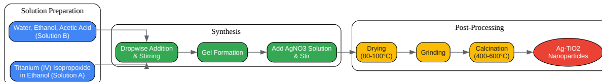
Diagram of Sol-Gel Synthesis Workflow:

Click to download full resolution via product page