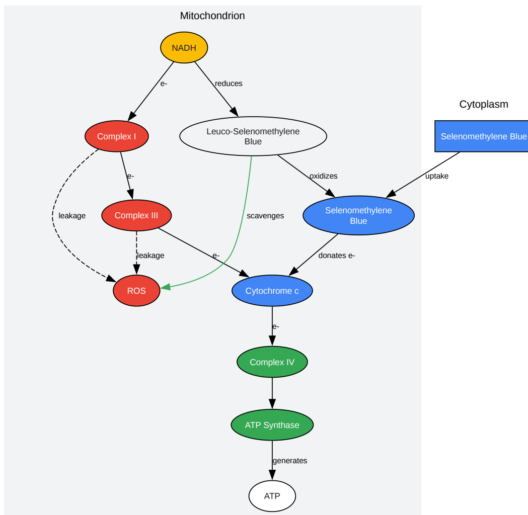
Proposed Mechanism of Selenomethylene Blue in Mitochondria

Click to download full resolution via product page