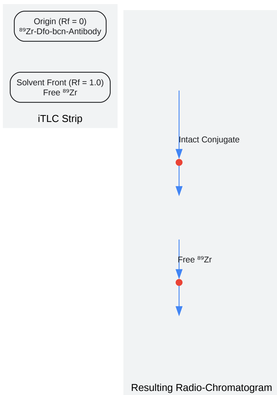
Figure 2: Principle of Radio-TLC for Radiochemical Purity

Click to download full resolution via product page