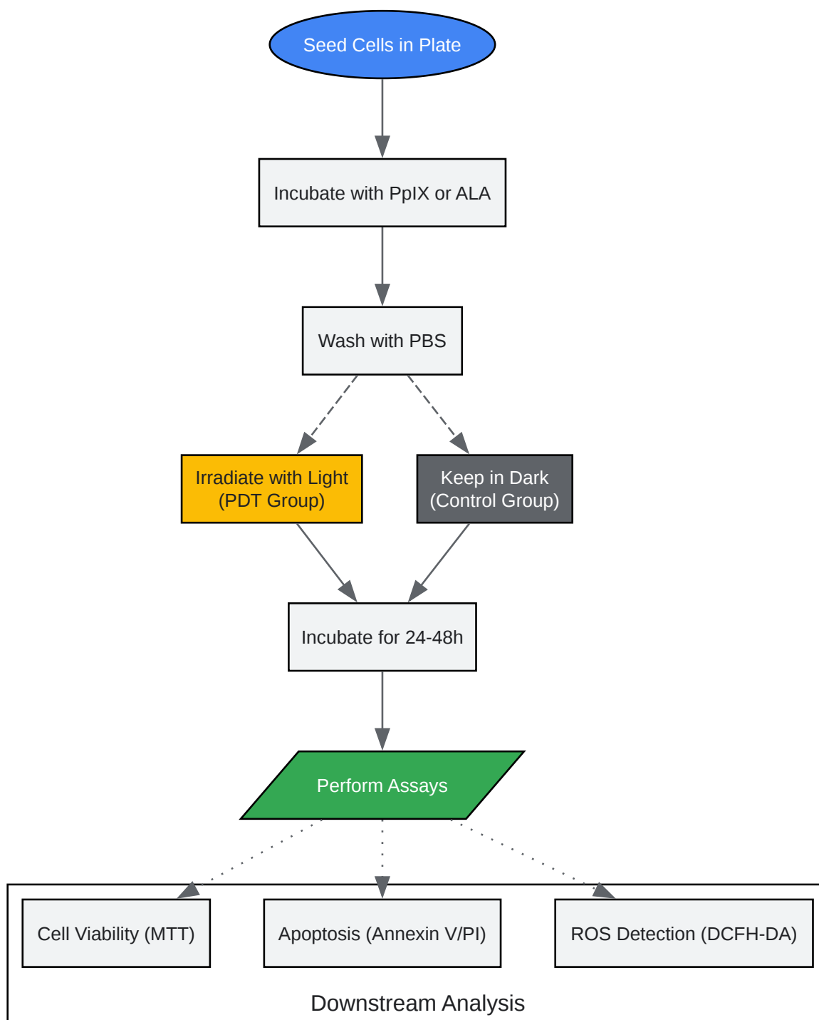
In Vitro PDT Experimental Workflow

Click to download full resolution via product page