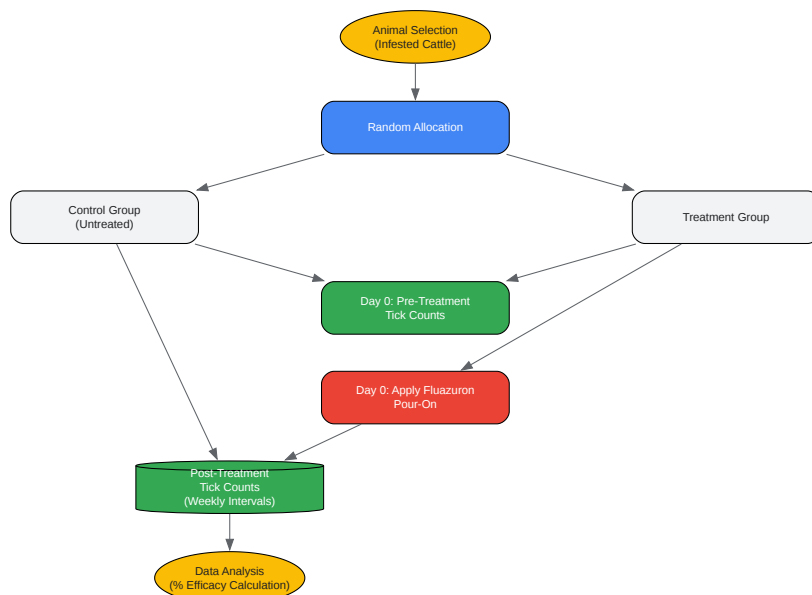
Figure 2: Efficacy Trial Workflow

Click to download full resolution via product page