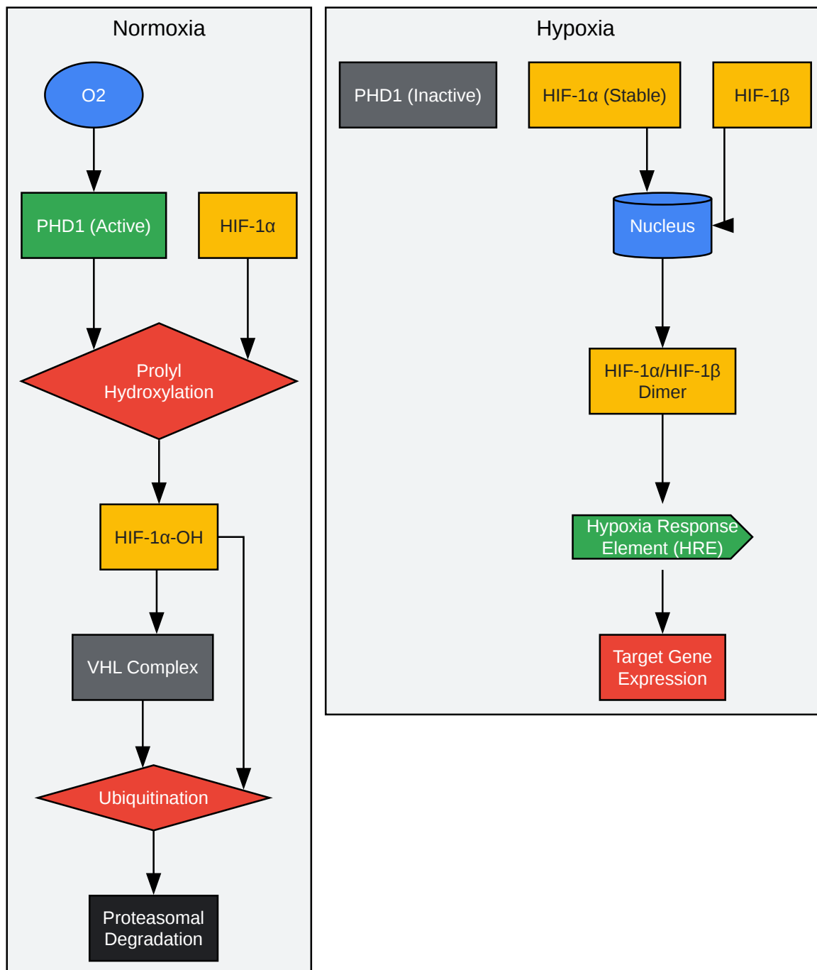
PHD1 Signaling Pathway

To visualize the core signaling pathway involving PHD1 and the experimental workflow for its activity measurement, the following diagrams are provided.