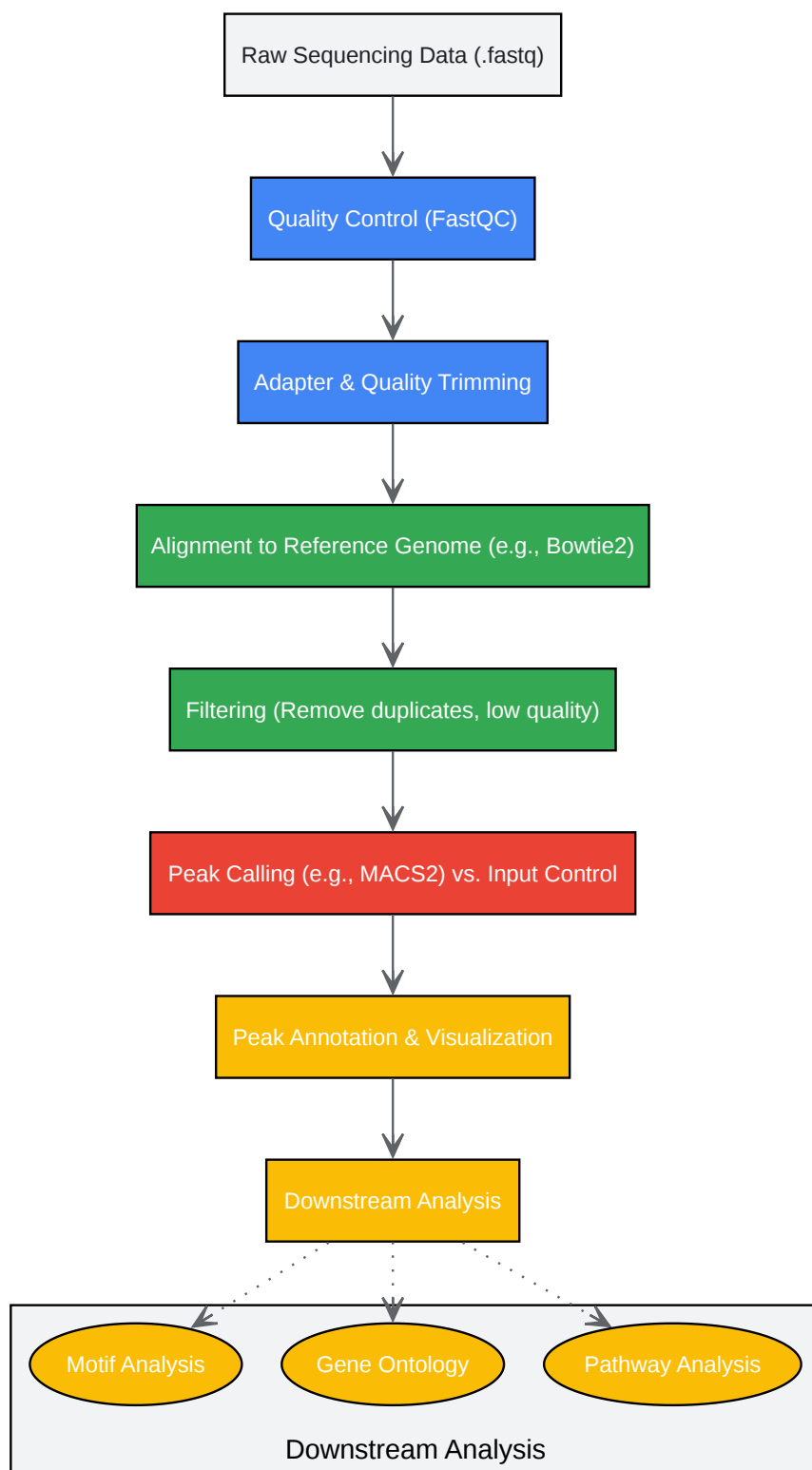
Figure 2: Bioinformatics Workflow for MED12 ChIP-seq Data

Click to download full resolution via product page