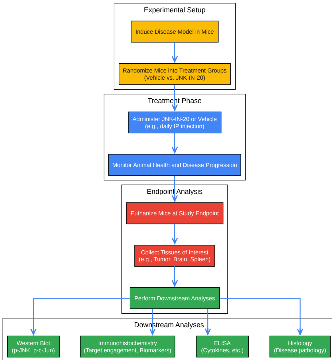
General Experimental Workflow for JNK-IN-20 in Mice

The following diagram illustrates a general workflow for evaluating the efficacy of JNK-IN-20 in a mouse model of disease.