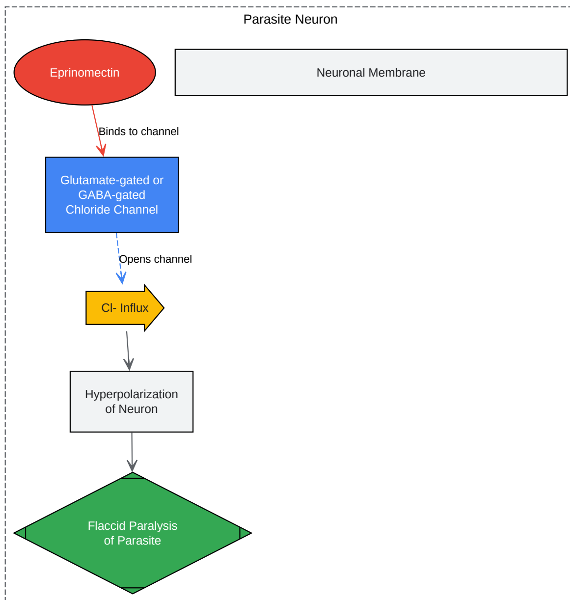
Diagram 2: Mechanism of Action of Eprinomectin

Click to download full resolution via product page