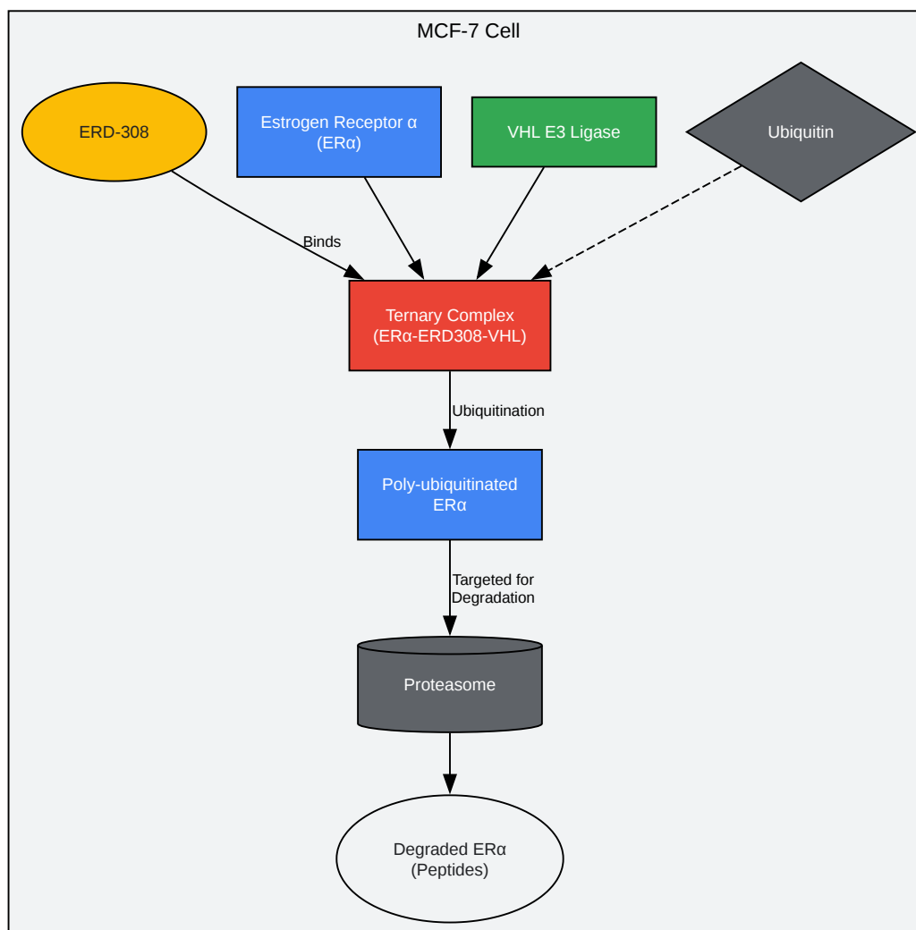
ERD-308 Mechanism of Action in MCF-7 Cells