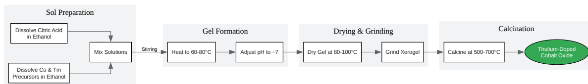
Caption: Workflow for the Co-Precipitation Method.

Click to download full resolution via product page