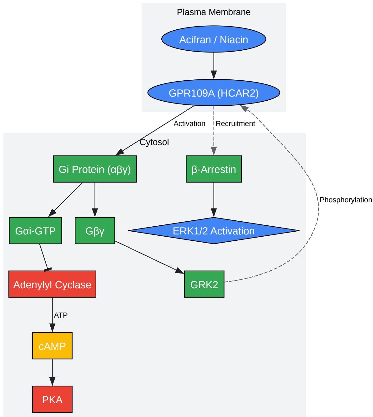
Simplified Acifran/Niacin Signaling Pathway via GPR109A

Click to download full resolution via product page