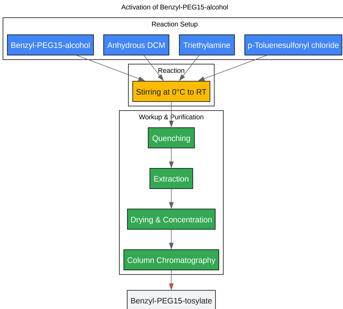
Diagram 1: Synthesis of Benzyl-PEG15-tosylate

Click to download full resolution via product page