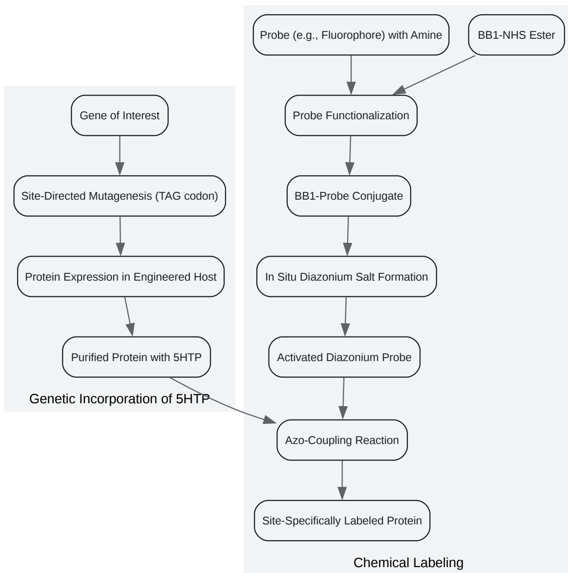
Figure 1. Experimental Workflow for CRACR

Click to download full resolution via product page