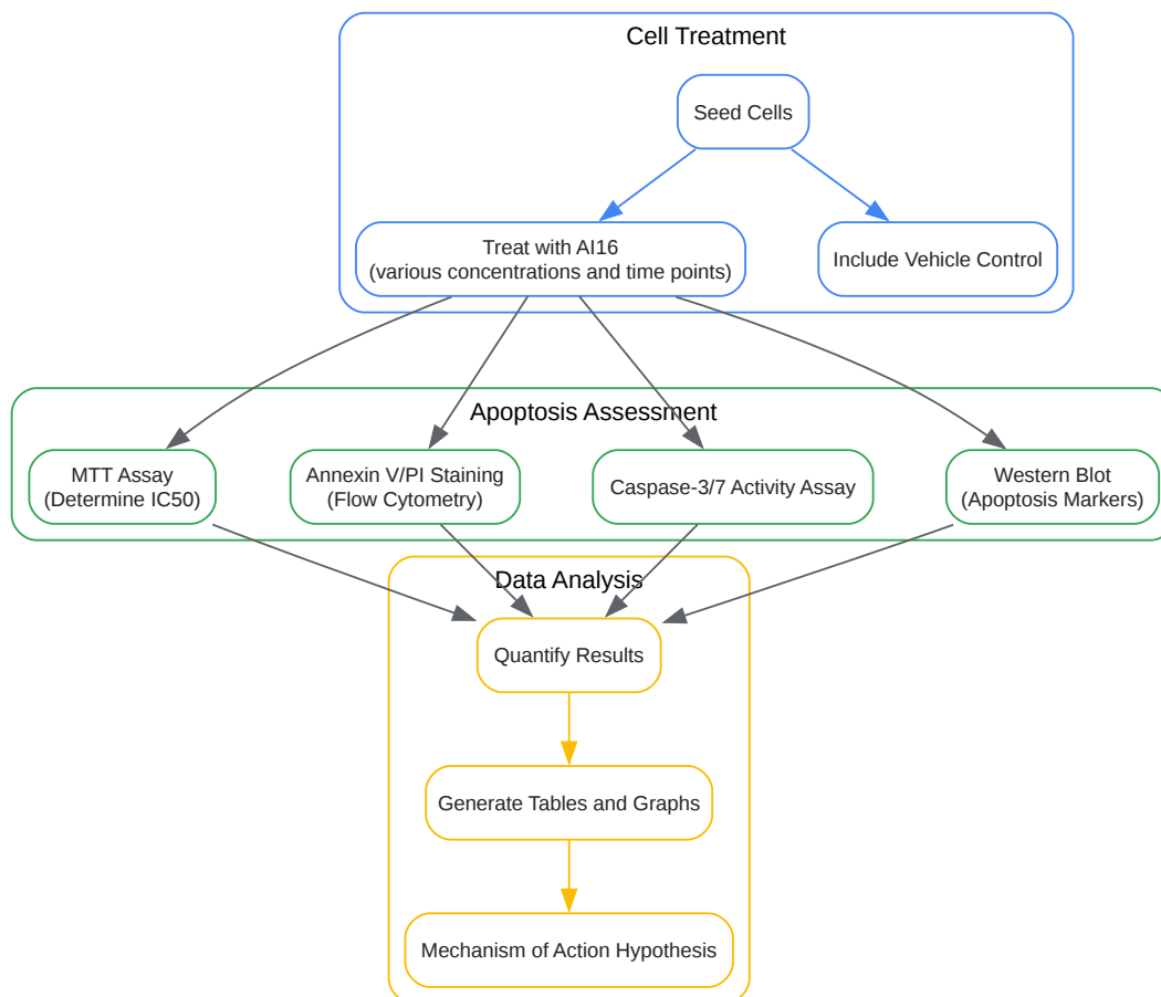
Figure 1: General Experimental Workflow for AI16

Click to download full resolution via product page