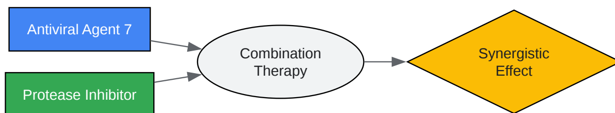
Caption: Workflow for in vitro evaluation of combination antiviral therapy.

Click to download full resolution via product page