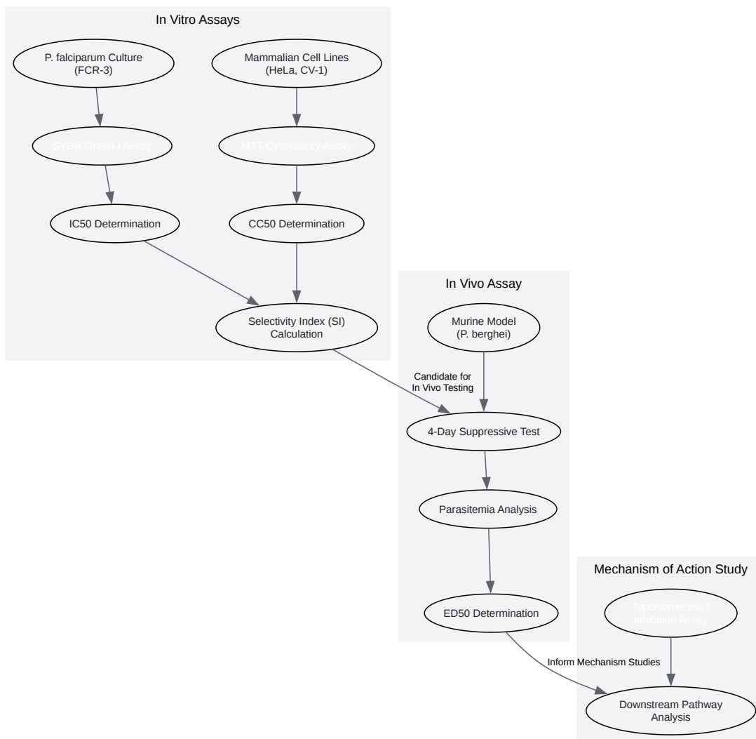
Overall Experimental Workflow for Calothrix B Antimalarial Testing