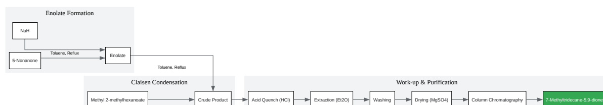
Diagram 1: Synthetic Workflow for 7-Methyltridecane-5,9-dione

Click to download full resolution via product page