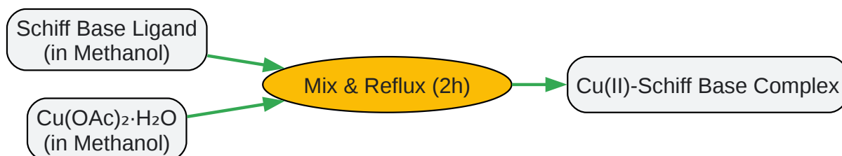
Diagram of Complexation:

Click to download full resolution via product page