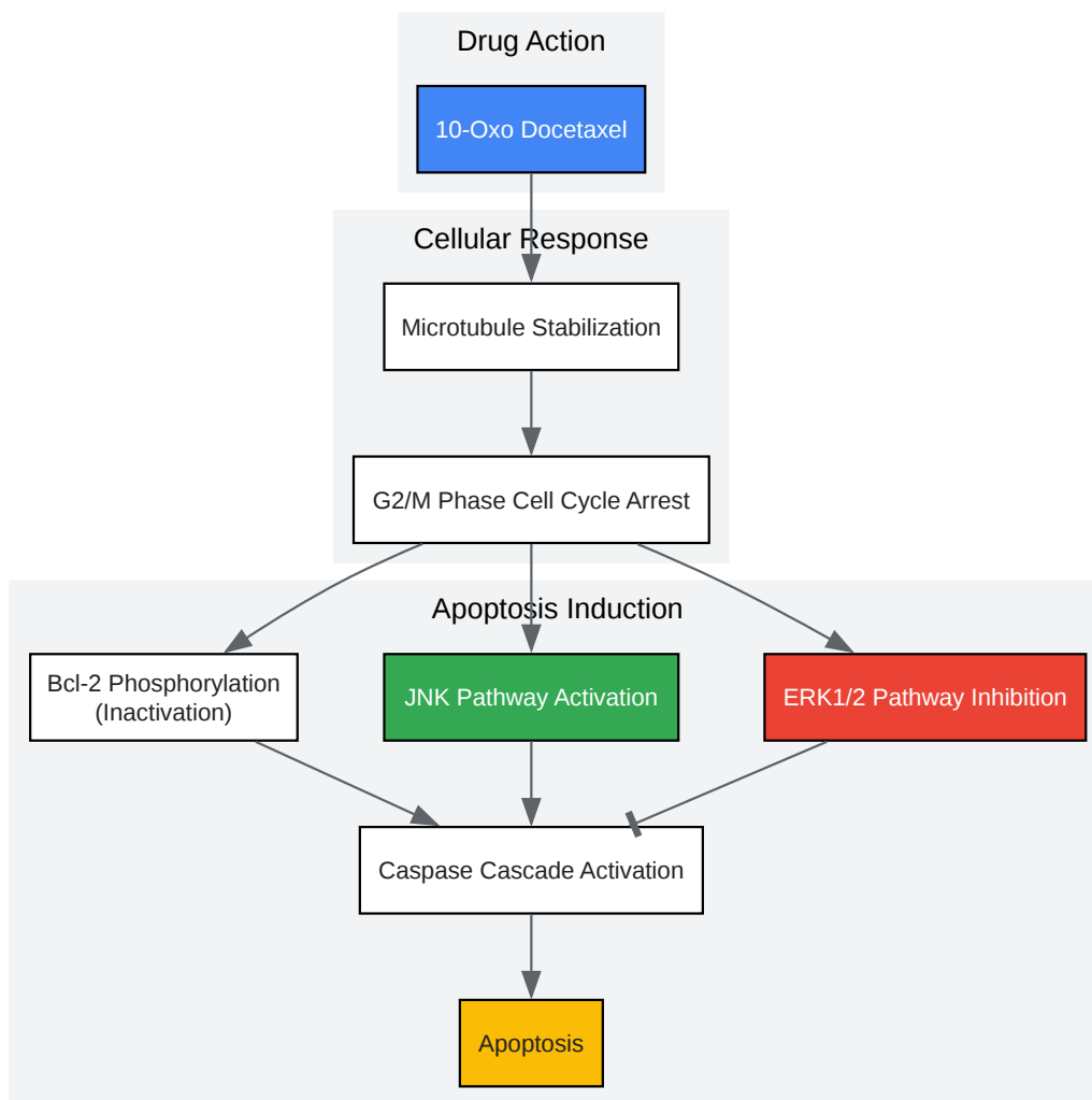
Proposed Signaling Pathway of 10-Oxo Docetaxel

Click to download full resolution via product page