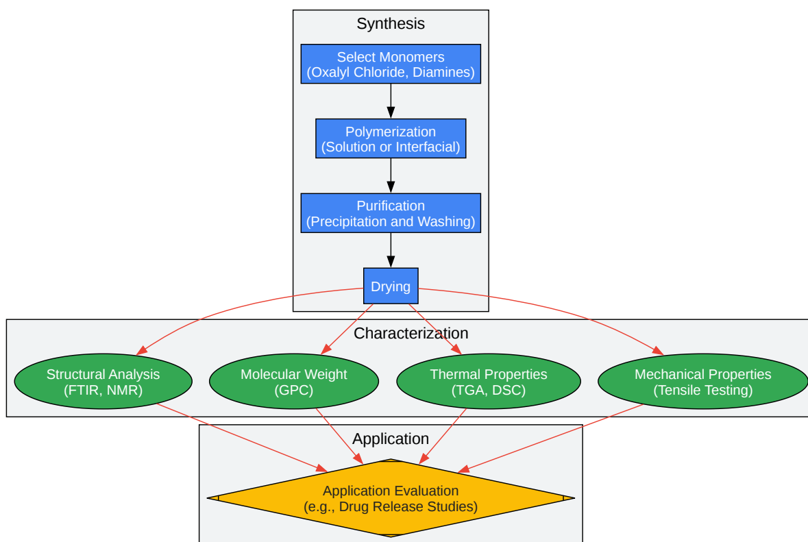
Workflow for Oxanilide-Based Copolymer Synthesis and Characterization

Click to download full resolution via product page