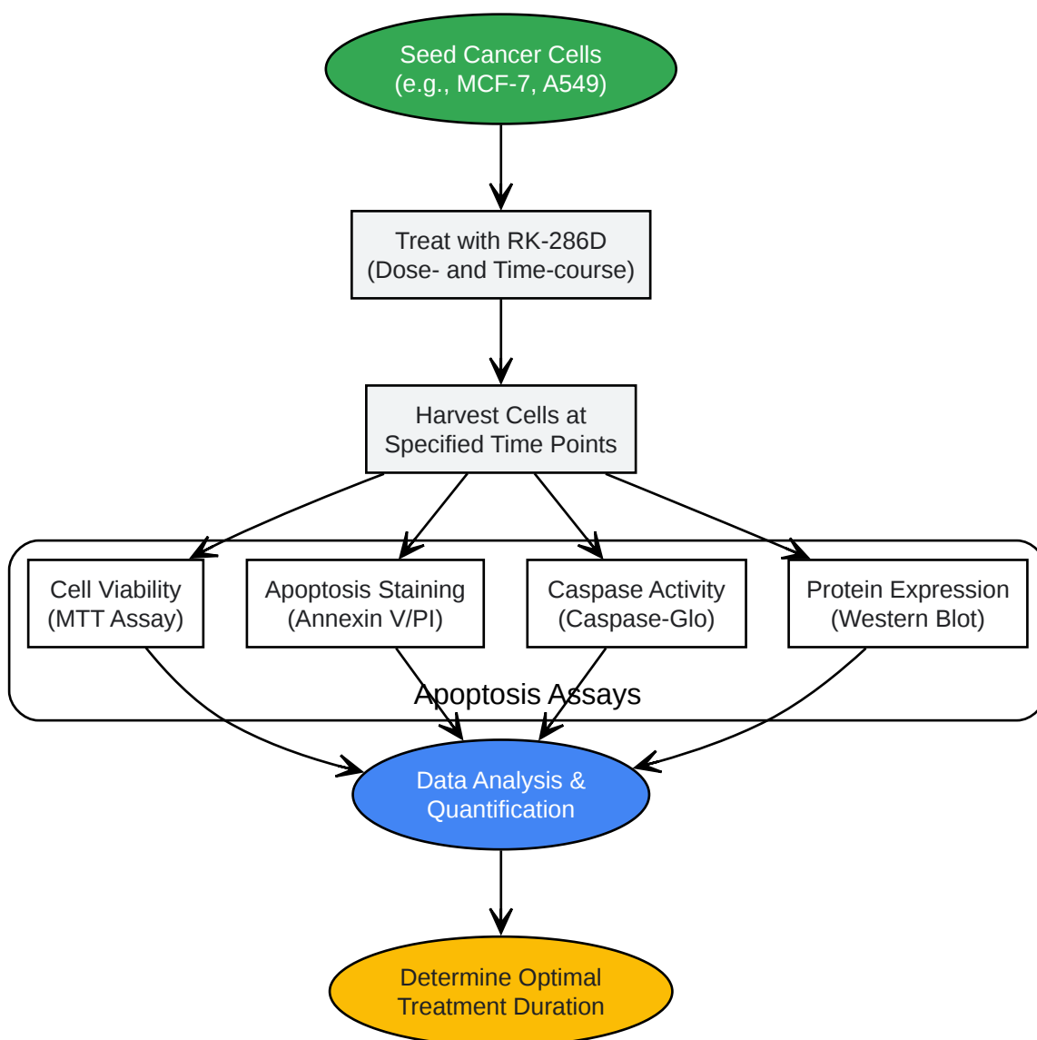
Figure 2: Experimental Workflow for Apoptosis Assessment

Click to download full resolution via product page