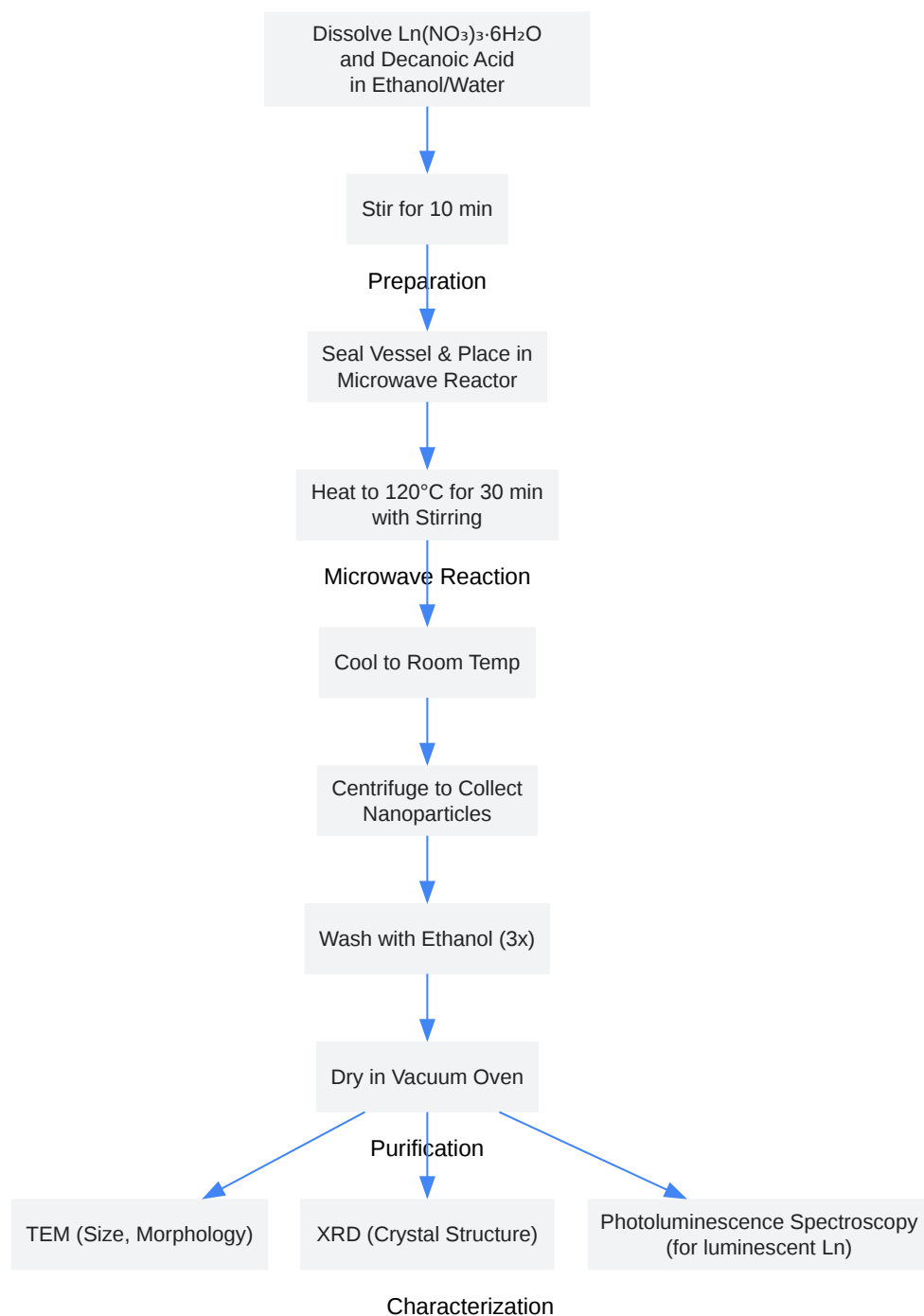
Diagram 1: Microwave-Assisted Synthesis of Lanthanide Decanoate Nanoparticles