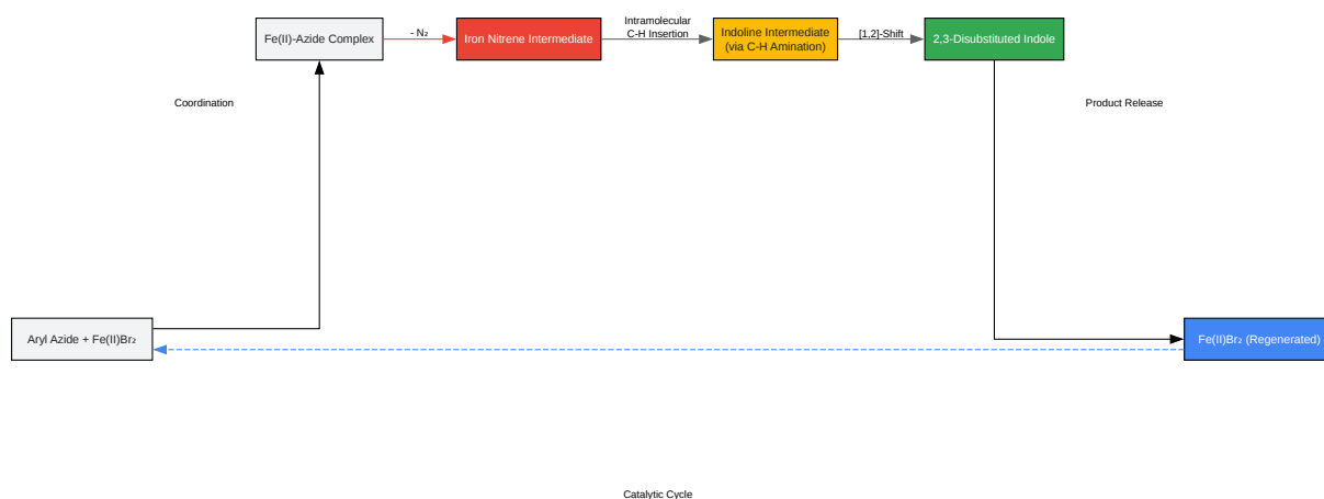
Proposed Reaction Pathway for FeBr 2 -Catalyzed C–H Amination–[1,2]-Shift

Click to download full resolution via product page