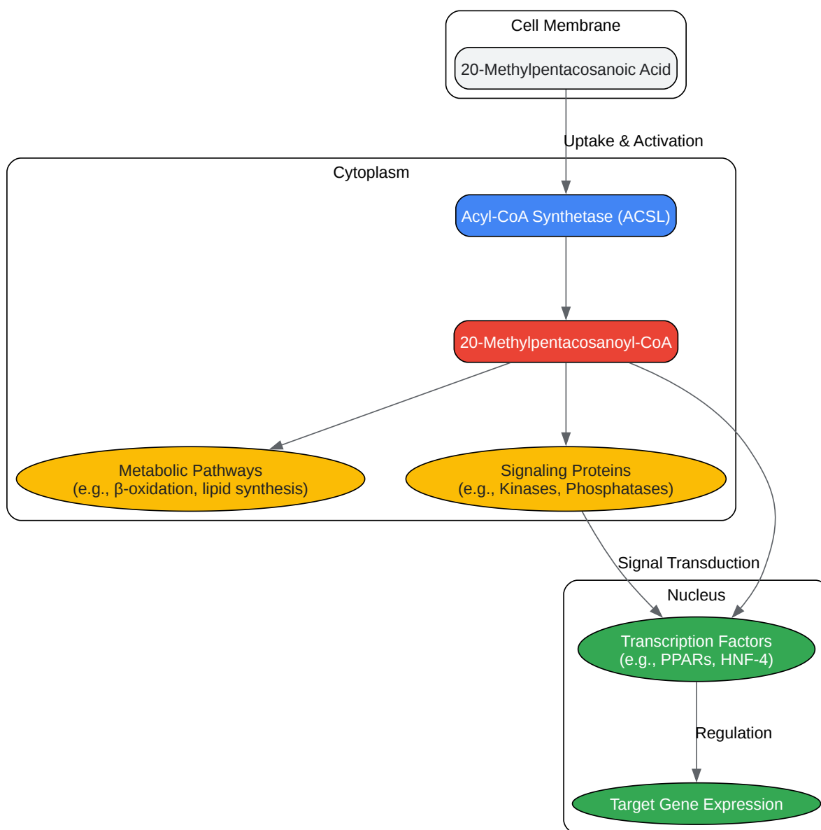
Diagram: Potential Signaling Pathways of 20-Methylpentacosanoyl-CoA

Click to download full resolution via product page