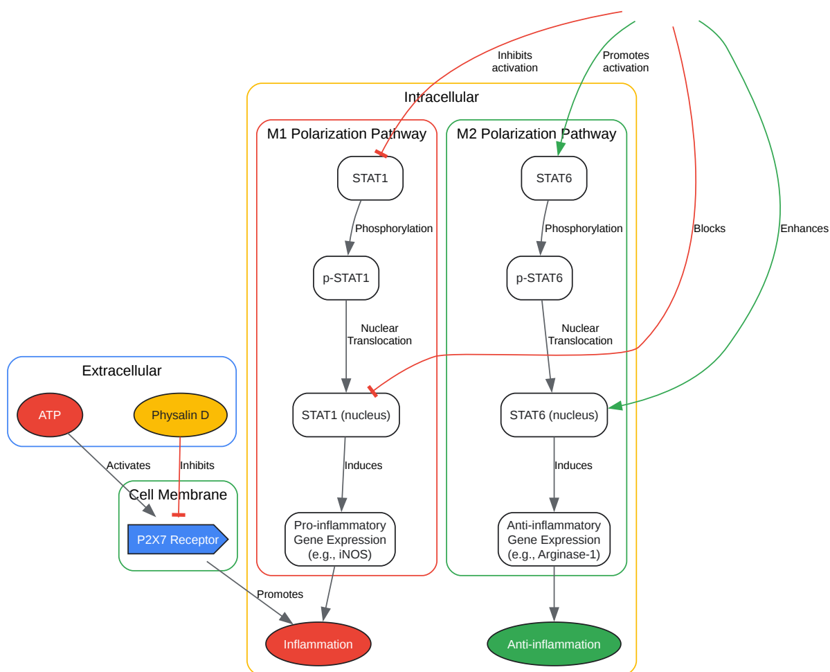
Caption: Workflow for Anti-Inflammatory Activity Assessment.

Click to download full resolution via product page