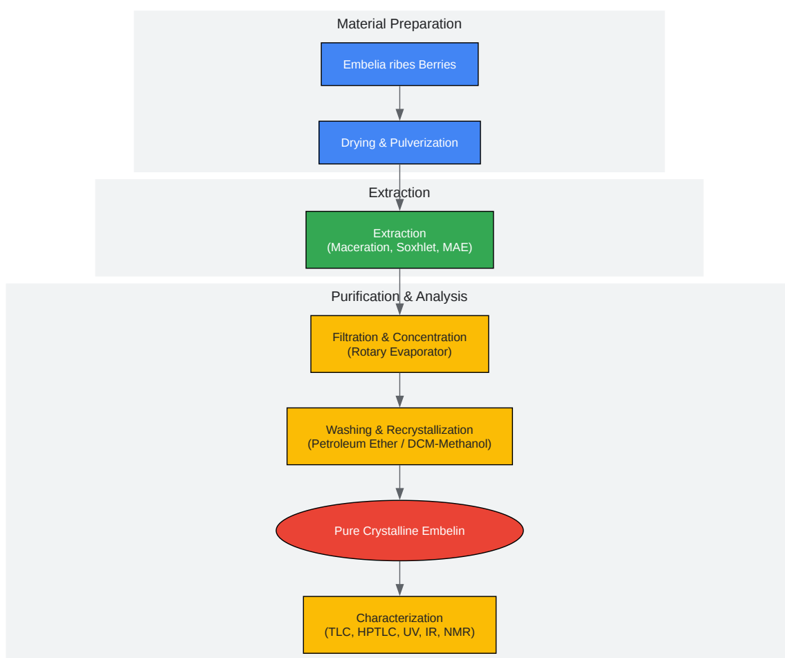
General Workflow for Embelin Extraction

The following diagram illustrates the sequential steps involved in the isolation and purification of embelin from Embelia ribes berries.