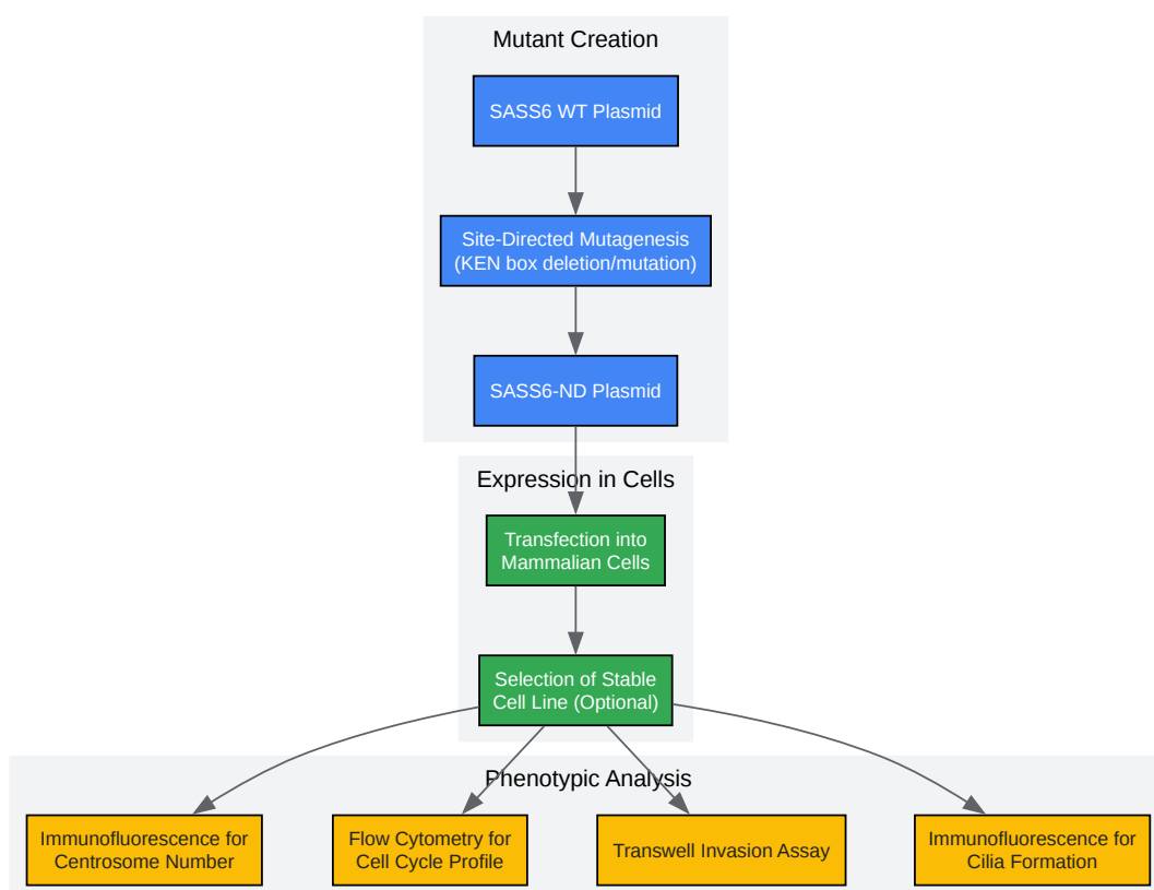
Workflow for Non-Degradable SASS6 Mutant Analysis

Click to download full resolution via product page