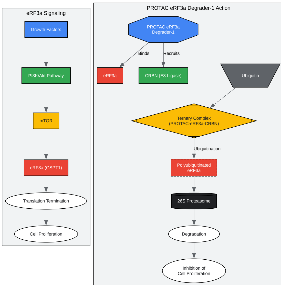
eRF3a Signaling and PROTAC eRF3a Degrader-1 Mechanism

The following diagram illustrates the simplified signaling pathway involving eRF3a and the mechanism of action for PROTAC eRF3a Degrader-1 .