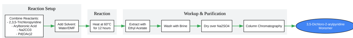
Diagram of Experimental Workflow:

Click to download full resolution via product page