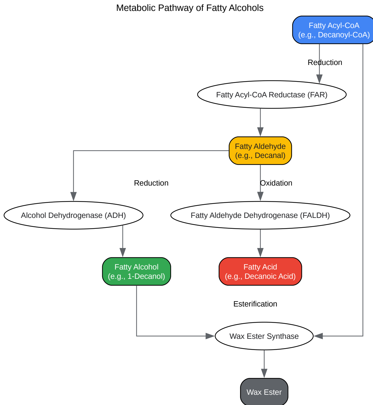
Caption: GC-MS workflow for 1-decanol quantification.

Click to download full resolution via product page