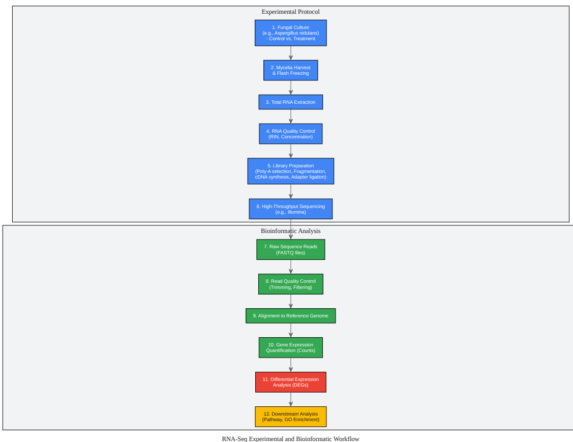
RNA-Seq Experimental and Bioinformatic Workflow

Click to download full resolution via product page