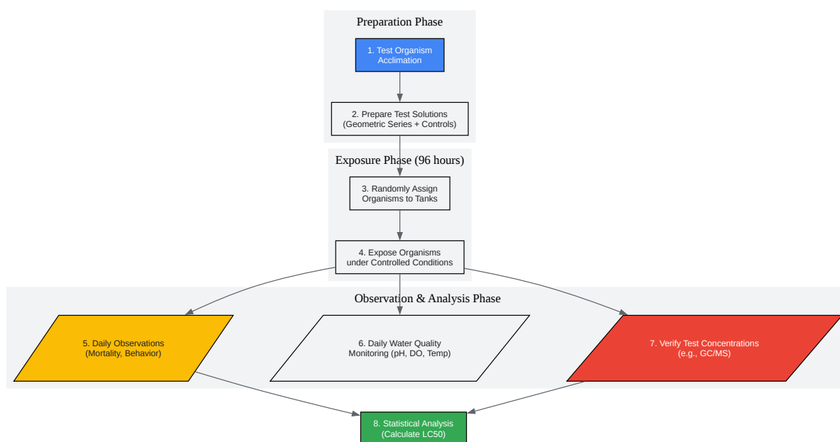
Figure 3: Workflow for Aquatic Toxicity Testing

Click to download full resolution via product page