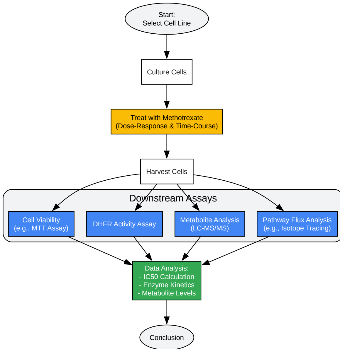
Diagram 3: Experimental Workflow for Studying Methotrexate Effects

Click to download full resolution via product page