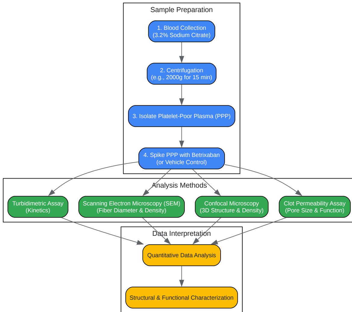
Experimental Workflow for Clot Structure Analysis

A typical investigation into betrixaban 's effects on clot structure involves several stages, from sample preparation to multi-modal analysis. The workflow allows for a comprehensive characterization, combining kinetic data with high-resolution imaging and functional properties.