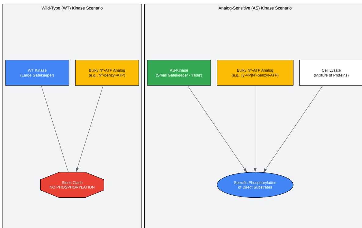
Diagram: Analog-Sensitive Kinase "Bump-and-Hole" Strategy

Click to download full resolution via product page