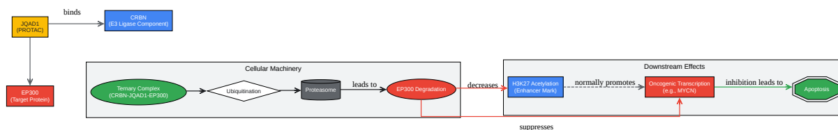
Diagram 1: JQAD1 Mechanism of Action

Click to download full resolution via product page